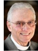
Alan Mead, Communications Minister